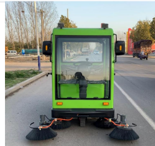
Compact and maneuverable design suitable for urban and municipal applications.