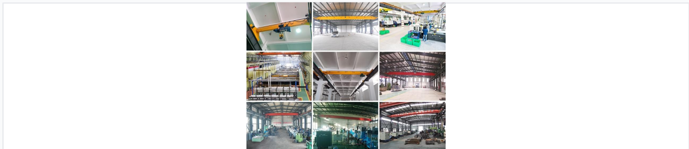
A typical EOT crane installation in an industrial workshop, showcasing the bridge girder and hoist mechanism.