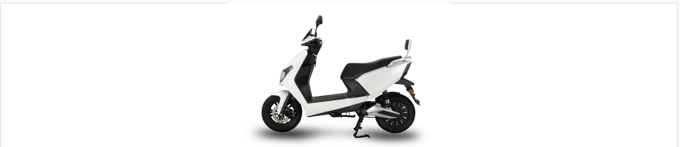
Modern design featuring a comfortable seat and robust bodywork.