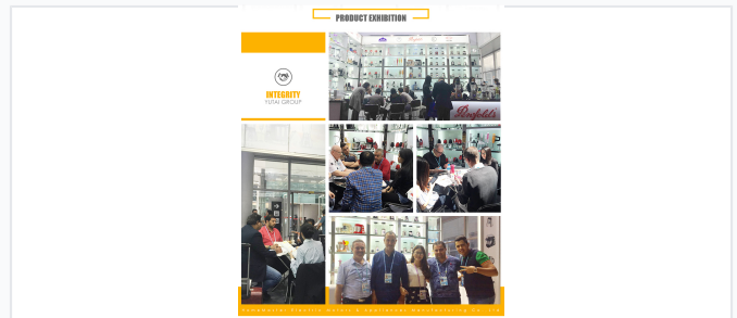
Showcase of kitchen appliance design and utility.