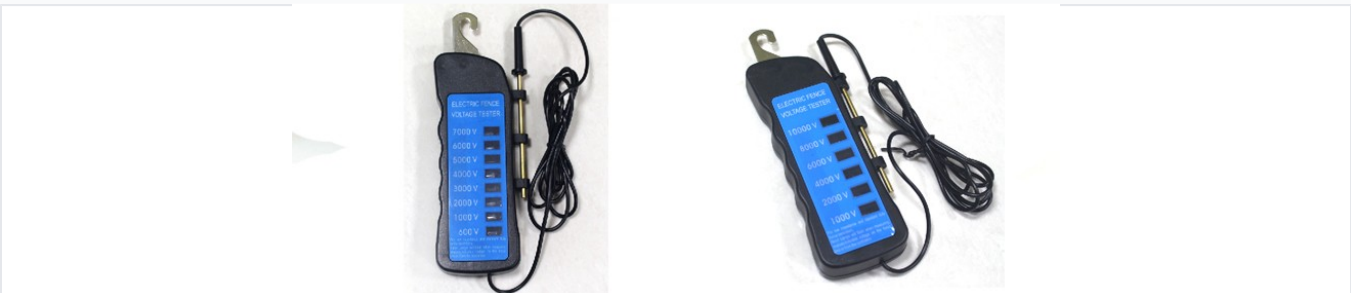
Easy-to-read LED indicators display voltage levels from 1000V to 10000V.