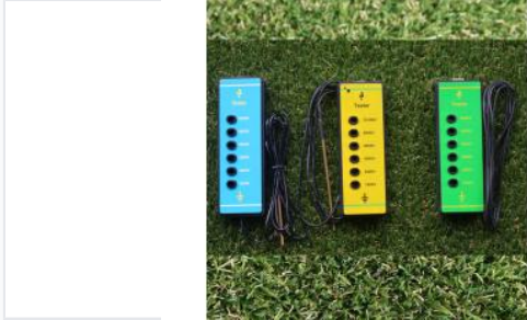
Compact and portable design suitable for field use.