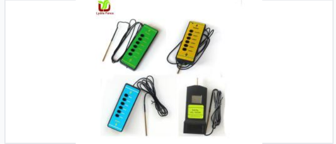
Includes a probe for grounding and a contact point for the fence wire.