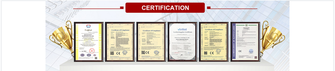
Regulatory compliance and quality certification.