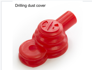
Drilling dust cover