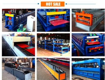
Our machines feature beautiful appearance, simple operation, reasonable price, good quality and so on.