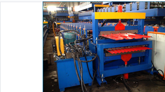
Complete double-layer roll forming line featuring robust steel frame and integrated hydraulic systems.