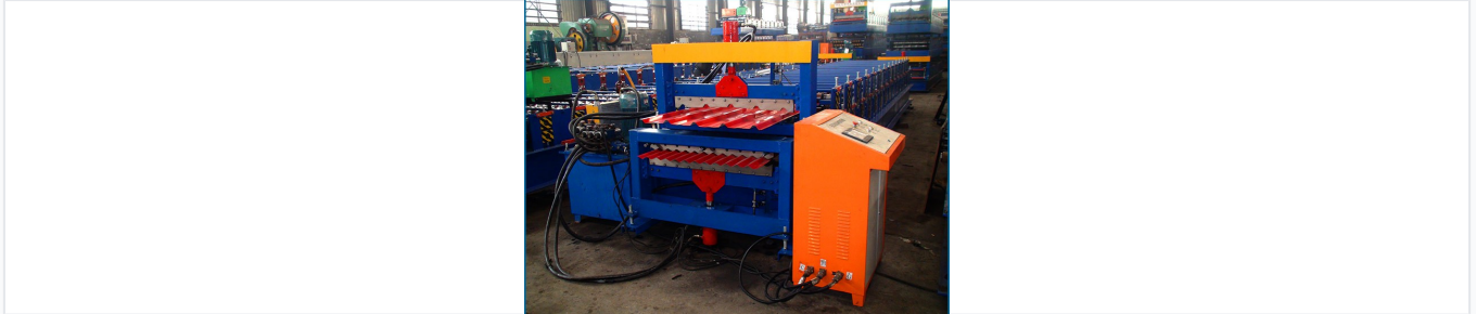
Detailed view of the dual-layer forming stations designed for high-volume production.