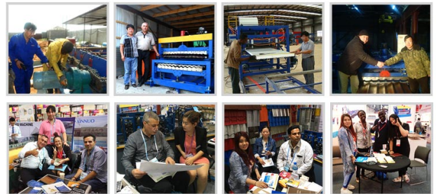
The machine produces high-quality, durable color steel roofing tiles with precise profiles.