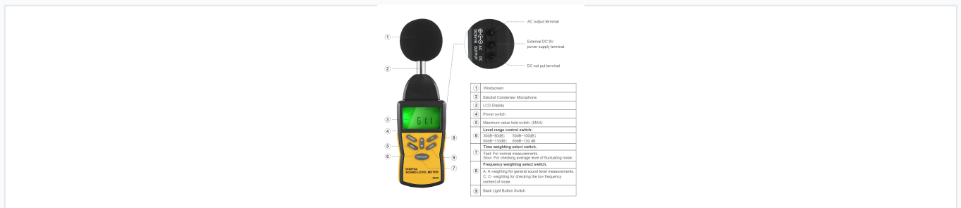
Detailed view of the interface including frequency weighting (A/C), time weighting (Fast/Slow), and AC/DC output terminals.