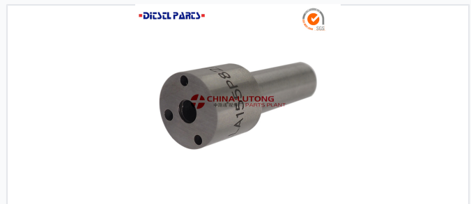
High-durability nozzle component designed for optimal fuel atomization.