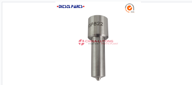
Precision-engineered diesel fuel injector nozzle for common rail systems.