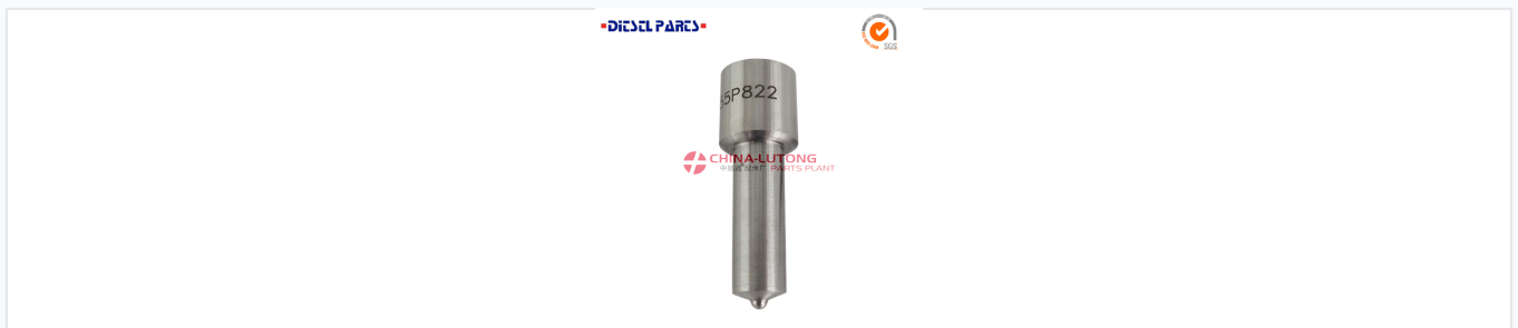
Close-up of the DLLA155P1062 nozzle showing high-precision engineering for Toyota common rail systems.