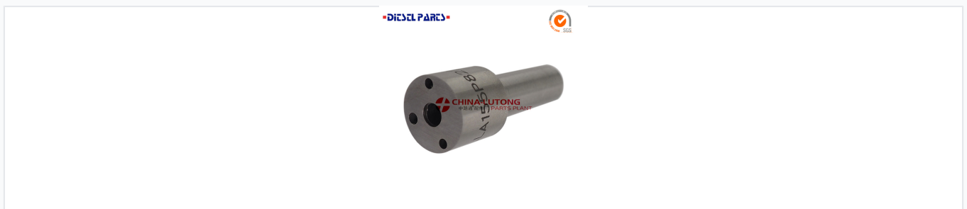
The nozzle is designed for efficient fuel atomization and improved engine performance.