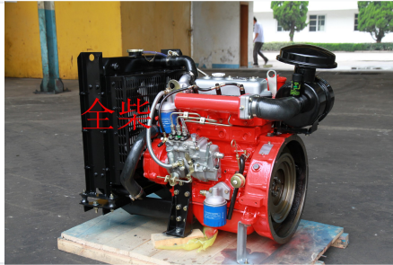
Detailed view of the integrated fuel and oil filtration systems designed for easy maintenance.