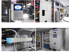
ELECTRICAL UNIT 电器单元