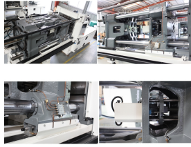
CLAMPING UNIT 锁模单元