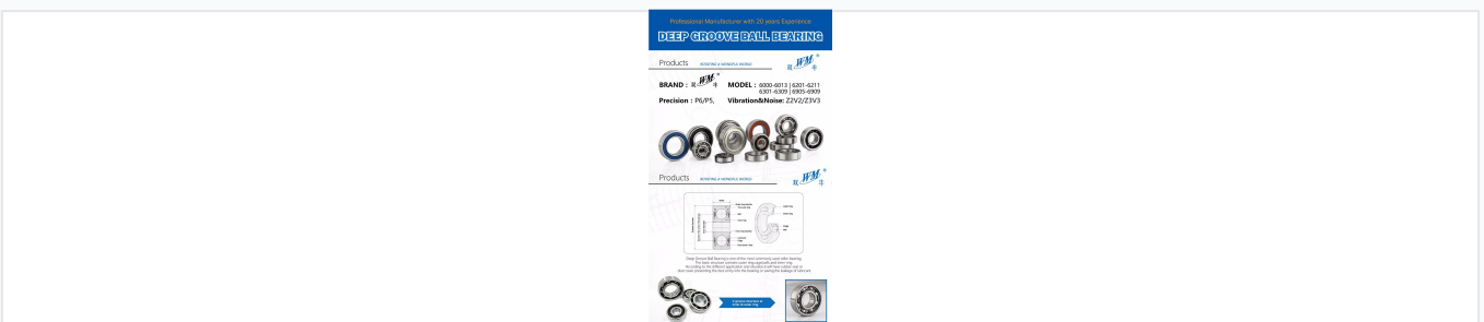
Internal structure showing outer ring, inner ring, cage, balls, and sealing options.