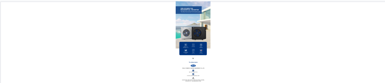
Efficiency and performance features of the DC-inverter residential pool heat pump.