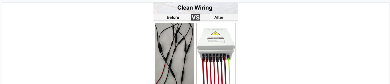
Simplify your solar installation with clean, organized wiring using a PV combiner box.