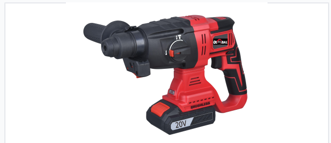
Professional 18V system components for high-efficiency operation.