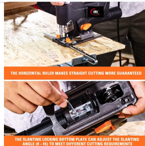
Adjustable bottom plate for 0-45 degree bevel cuts and integrated horizontal ruler.