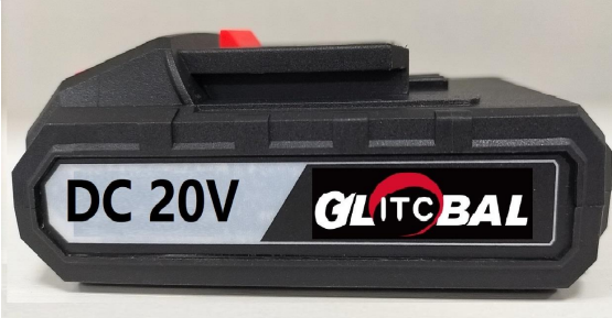
Compatible 18V/20V Max battery pack providing long-lasting power.