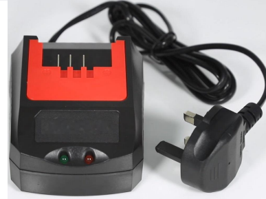
Quick charger with LED status indicators.