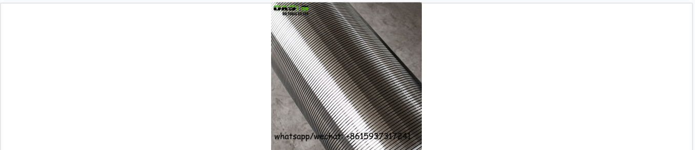
A detailed view of the robust fusion-welded construction and V-profile wire geometry.