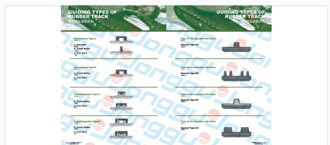
Visual guide to different track guiding configurations including Conventional and Interchangeable types.