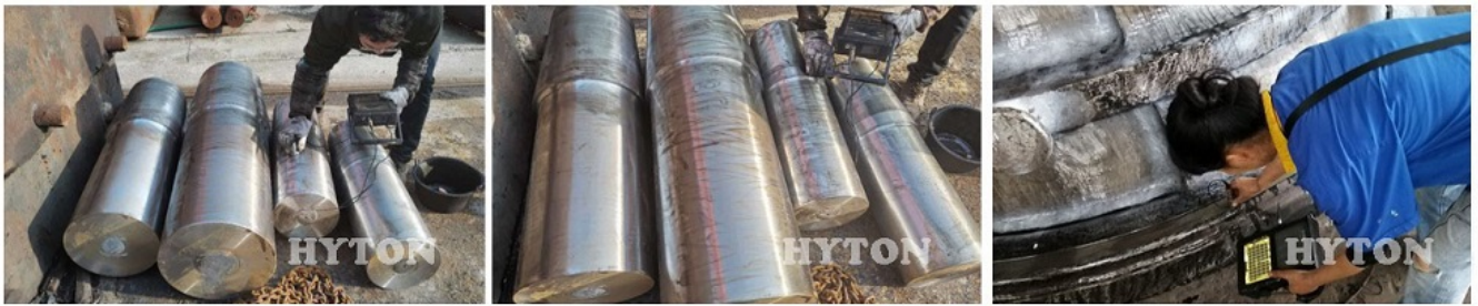
High-durability clamping components designed for secure crusher operation.