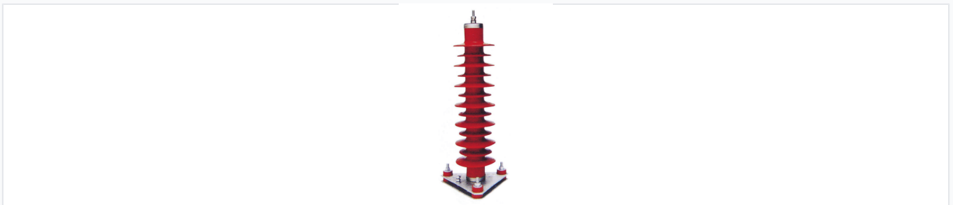
High-efficiency metal oxide surge arrester with composite housing.