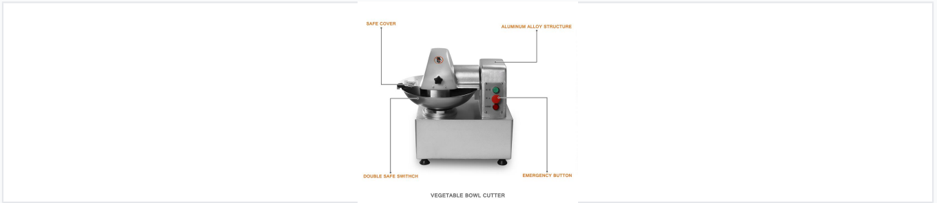
Detailed view of the aluminum alloy structure, safety cover, and emergency control buttons.