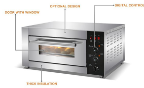
1 DECK 1 TRAY ELECTRIC OVEN

1-deck electric oven configuration equipped with a viewing window and digital control interface.