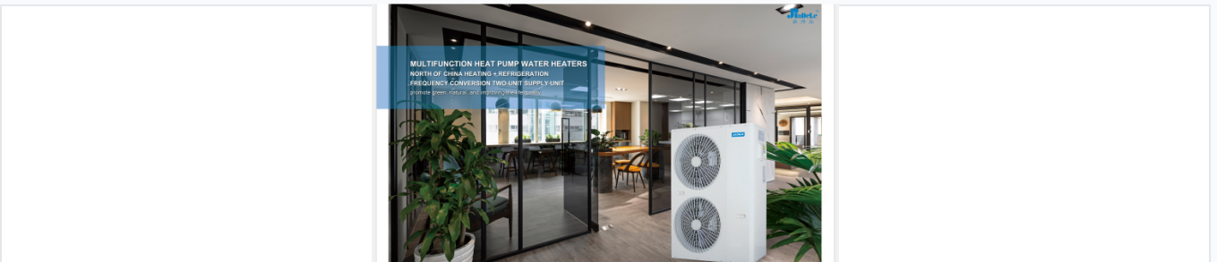
Multifunction heat pump system designed for efficient heating and refrigeration.