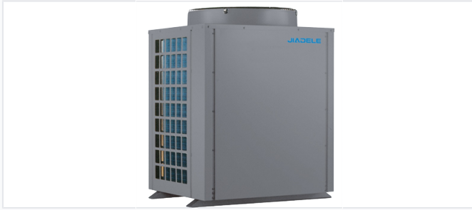
Robust inverter-driven unit designed for industrial heating demands.