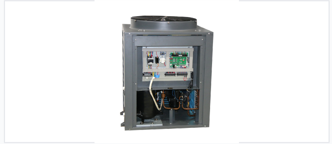
Detailed view of the control panel and high-efficiency internal components.