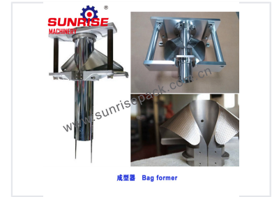
成型器 Bag former

This machine automates packaging processes, including feeding, measuring, filling, bag making, sealing, and cutting. It utilizes a PLC and computer control system with a color touch screen for convenient operation.