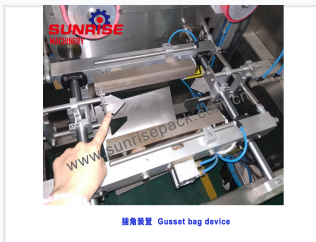
插袋装置 Gusset bag device