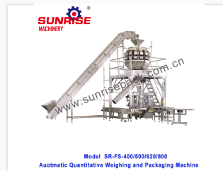
Model SR-FS-400/600/800 Automatic Quantitative Weighing and Packaging Machine