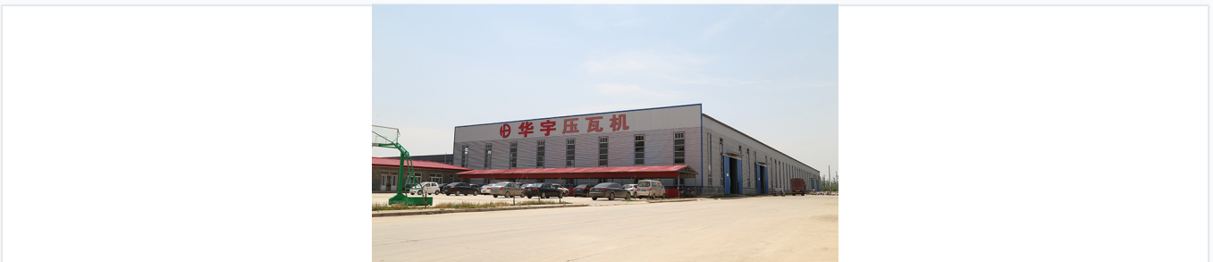
The machine features a robust steel frame and adjustable rollers for consistent tile quality.