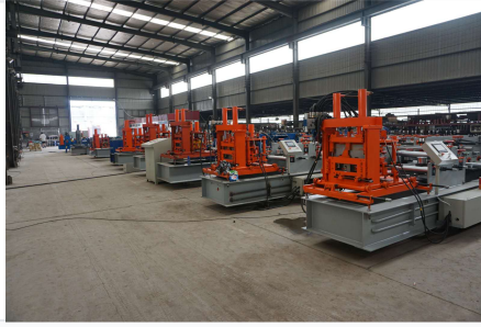
Detailed view of the forming stations and hydraulic systems.