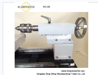
www.kingcarpenter.xyz Qingdao King Wing Woodworking Trade Co., Ltd