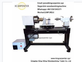
www.kingcarpenter.xyz Qingdao King Wing Woodworking Trade Co., Ltd