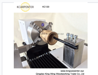
www.kingcarpenter.xyz Qingdao King Wing Woodworking Trade Co., Ltd