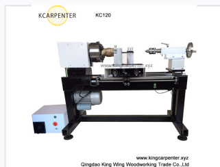
www.kingcarpenter.xyz Qingdao King Wing Woodworking Trade Co., Ltd