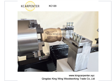
www.kingcarpenter.xyz Qingdao King Wing Woodworking Trade Co., Ltd

This CNC wood lathe is designed for creating wooden beads and intricate wood turnings. Its CNC control system allows for automated operation and precise control over the cutting process.