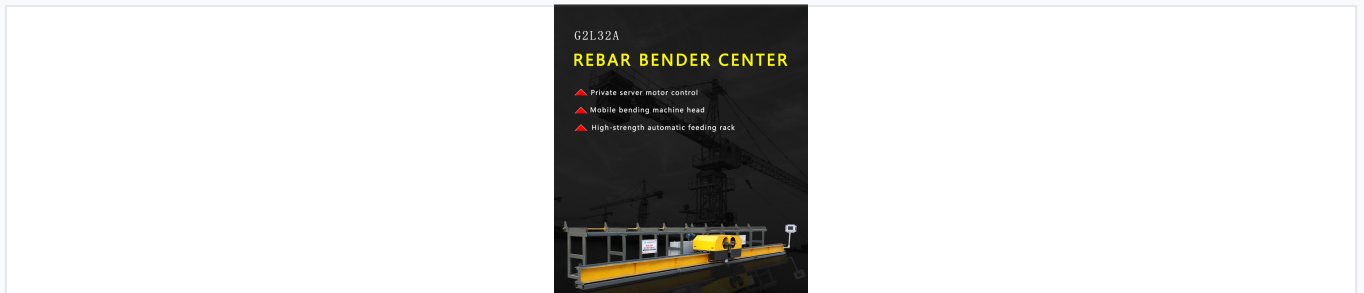
High-strength automatic feeding rack and mobile bending head.