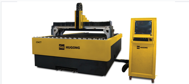
The main machine unit featuring a robust frame for industrial stability.