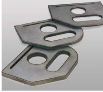
Examples of high-precision cuts achievable with the system.