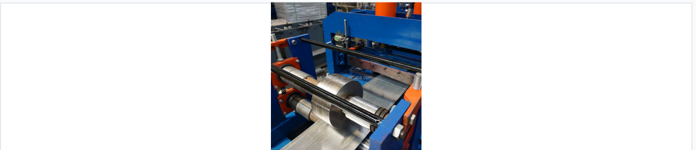
Robust construction featuring changeable profiles for both C and Z purlin production.