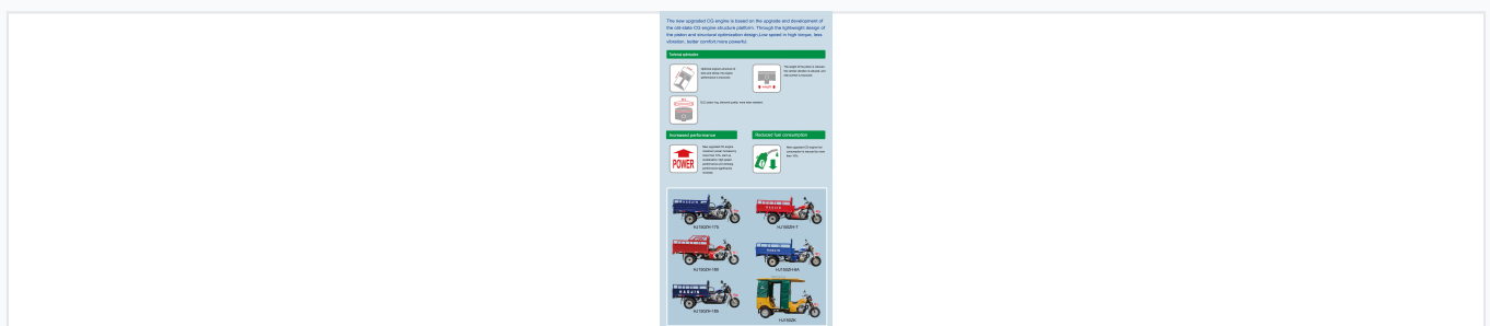
Technical optimization details, including piston weight reduction and performance improvements.