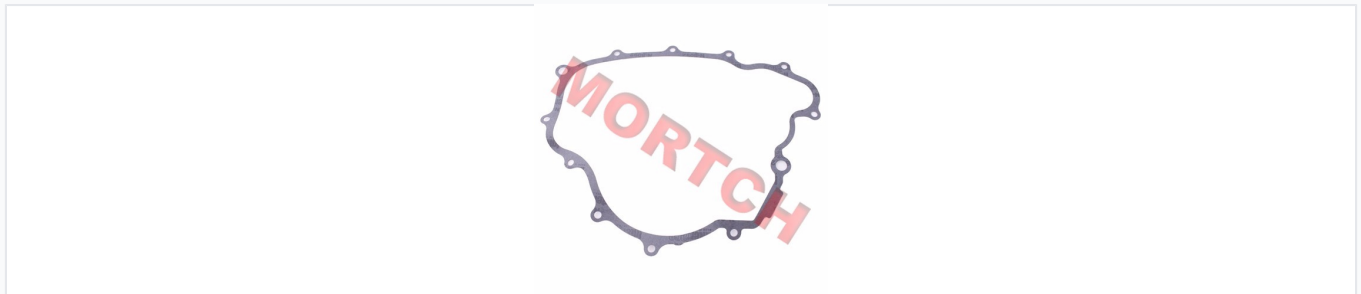
Precision-cut gasket designed for the CF500 left crankcase cover, ensuring a leak-proof seal.