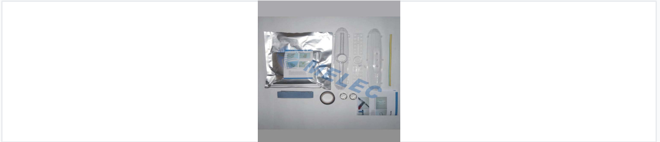
Complete kit components for cable jointing