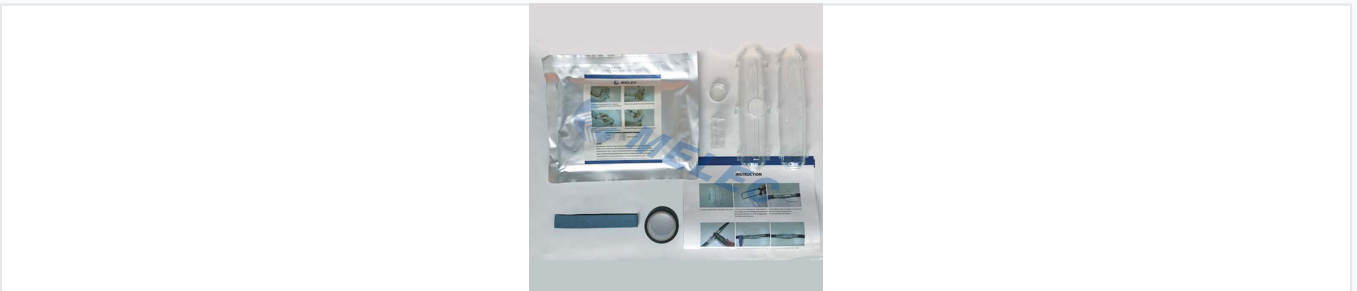
Durable cast resin encapsulation for cable protection