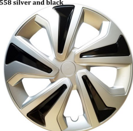
SHENZHEN TOPLEAD INDUSTRIAL CO.,LTD