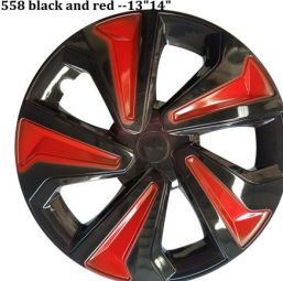
SHENZHEN TOPLEAD INDUSTRIAL CO.,LTD