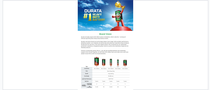
Environmentally conscious design with a 3-year shelf life.