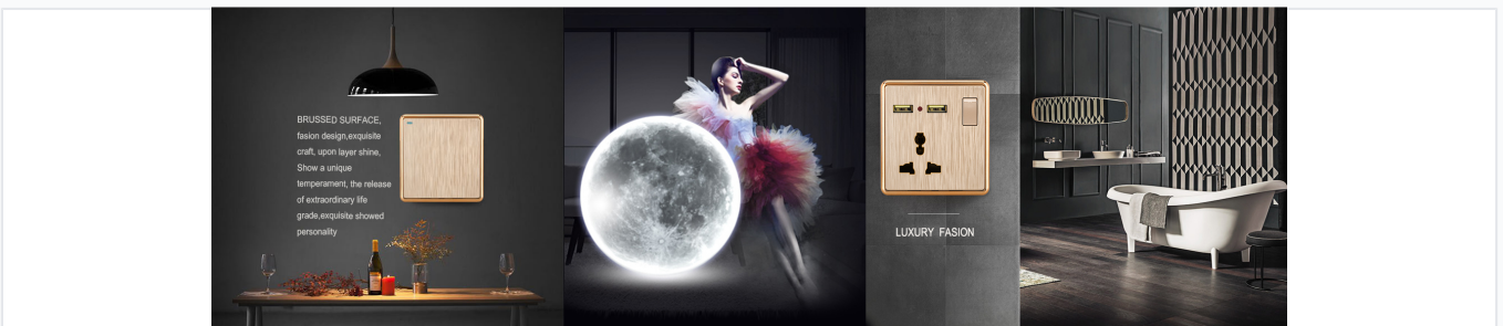
Refined brushed surface finish with luxury design elements.