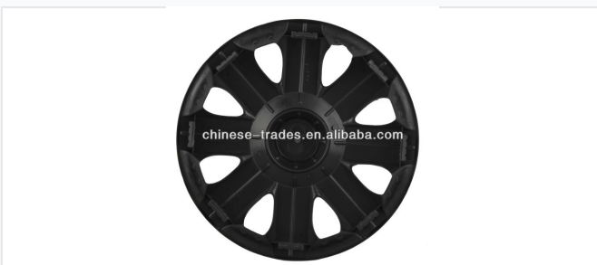
Stylish bi-color finish suitable for various automotive wheel styles.