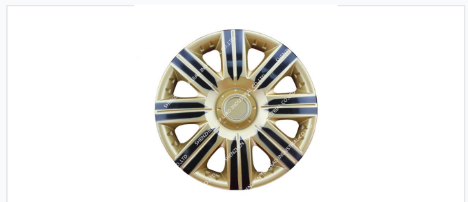
Durable ABS/PP construction with premium surface treatment.