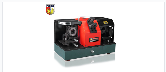
Compact design for professional workshop environments.