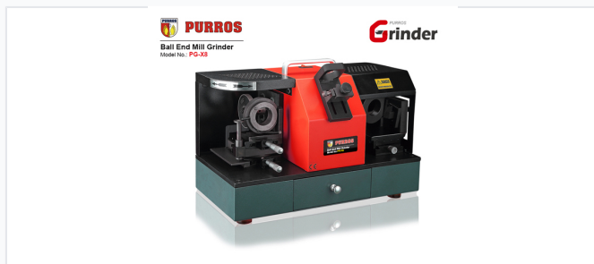
Professional ball end mill grinding machine design.