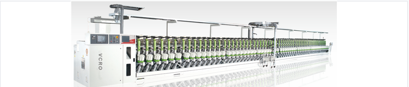
The VCRO automatic winder featuring a brand-new profile design for high-speed textile production.