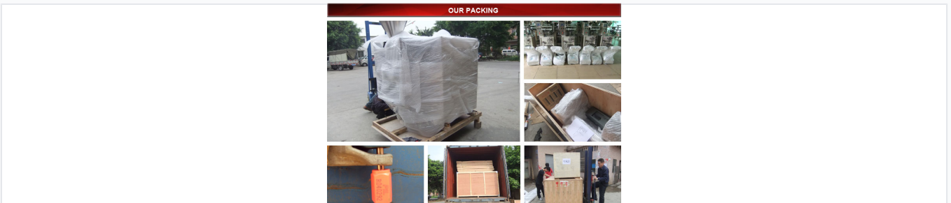
Machines are securely wrapped and crated in wooden pallets to ensure safe international transit.