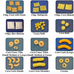
Example of various snack shapes and textures achievable with adjustable molds.