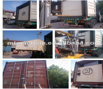
Robust construction designed for high-volume, continuous food processing operations.