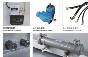
自动润滑装置 Auto Lubrication Device