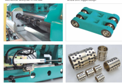
后架式机械安全杆 Mechanical Safety Bar in the Rear