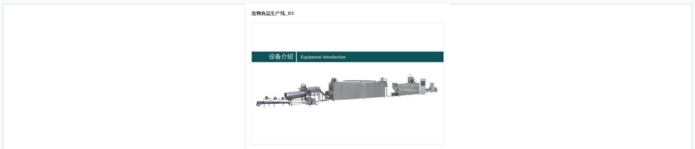
Complete automated line from raw material processing to final packaging.