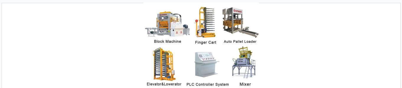
Comprehensive system layout including mixer, finger cart, and pallet handling.