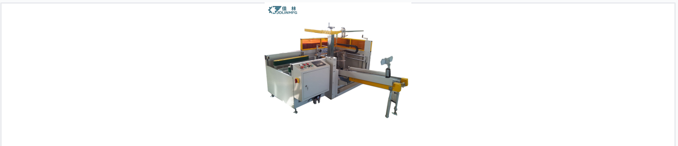
Full view of the automatic carton erector and bottom sealing system.