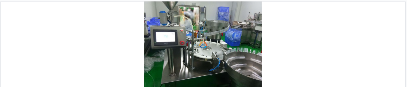
User-friendly PLC touch-screen interface for precise operational control.