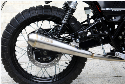
Robust rear tire tread and stainless steel exhaust system.