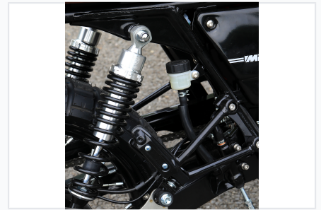
Detailed view of the mechanical rear suspension and hydraulic braking components.