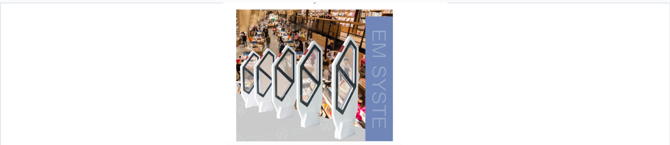
Modern EM security gates designed for library and bookstore entrances.